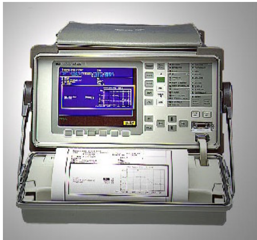
HP 37717C communications performance analyzer with color display, floppy disk drive as standard and optional integrated printer.

To meet your specific test needs, just order the capability you require. Simply order the HP 37717C analyzer and choose the application orientated options you require, from the tables in the pages that follow. Remember, you can configure your analyzer to simultaneously include PDH/DSn, SONET/SDH, ATM and jitter, or you can configure it to contain PDH/DSn only, SDH only, SONET/SDH only, ATM only or almost any combination.