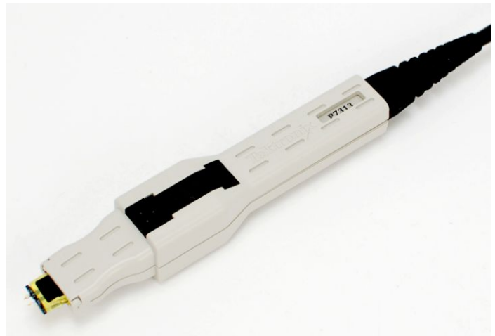
Handheld Adapter (HHA) accessory

Handheld and fixtured probing needs are met using the Handheld Adapter and Variable Spacing Tip-Clips.